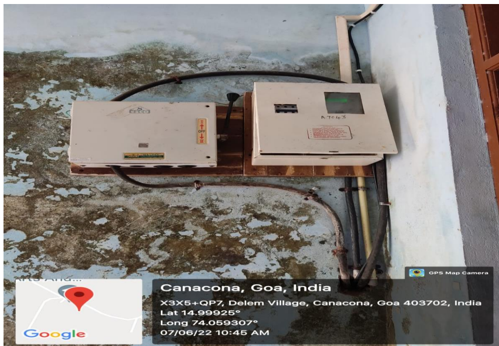
Master switch 2