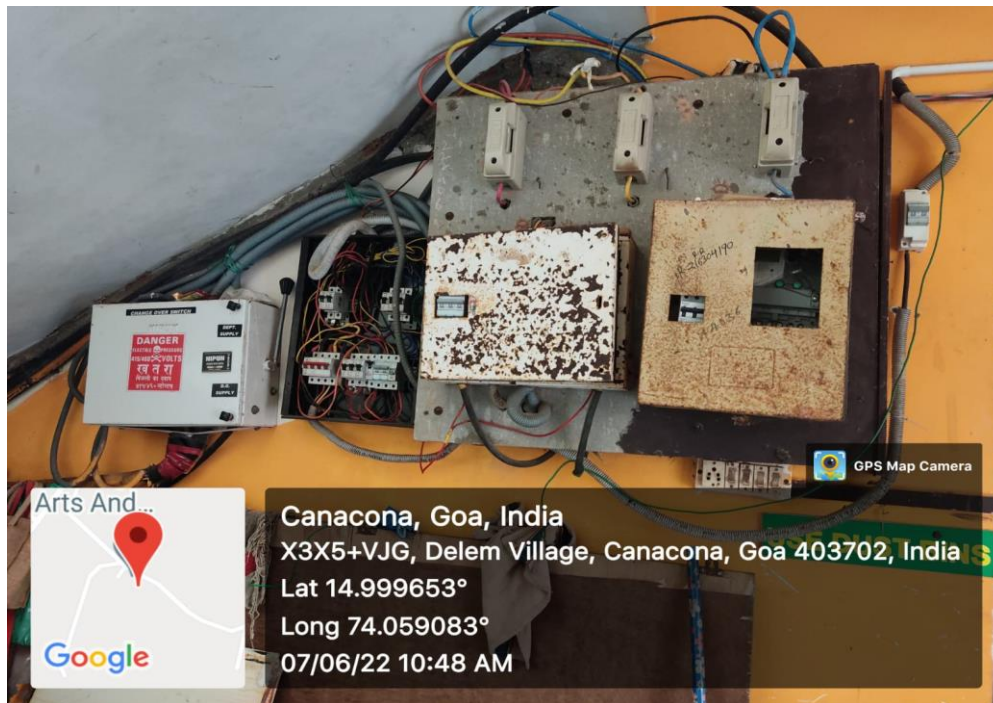
Master switch 1