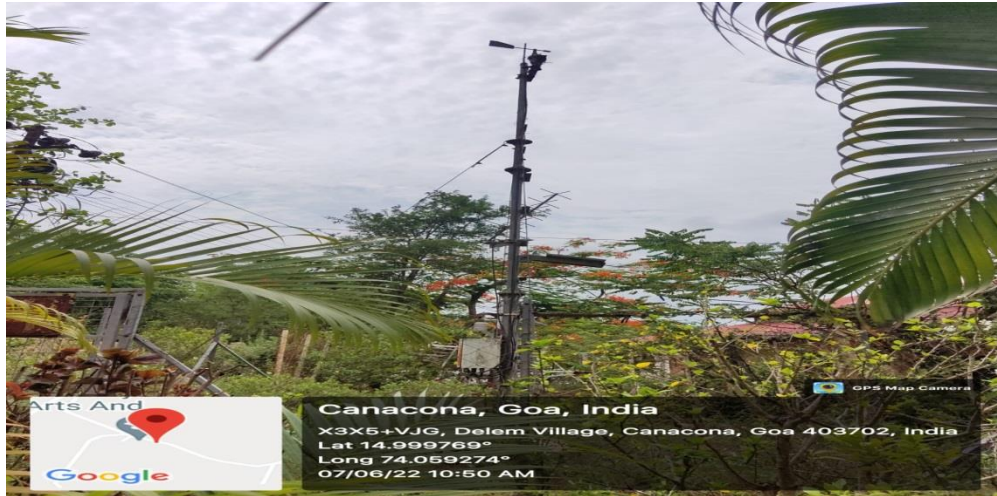
Weather station with solar backup facility