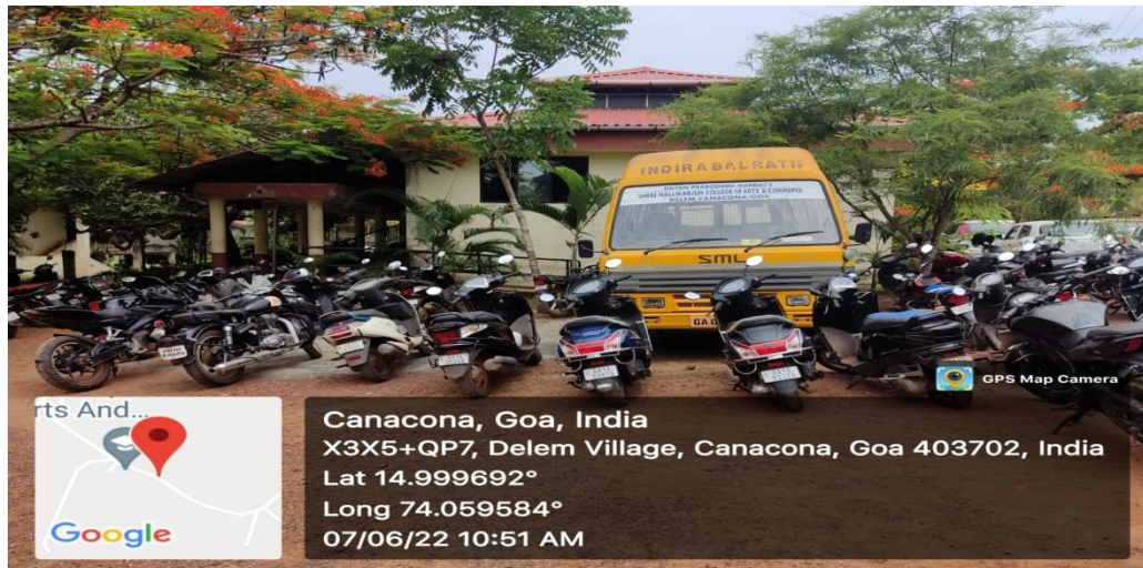
College bus facility for students