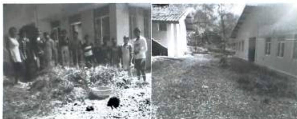
School Backyard Cleaning