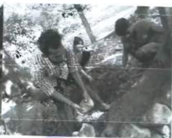
Construction Work In Progress