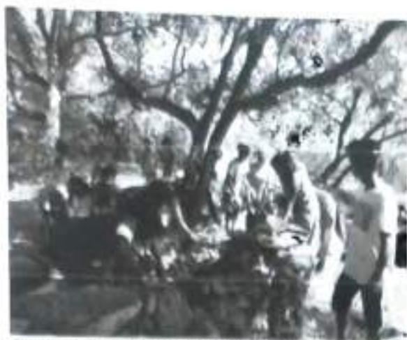
Construction Work In Progress