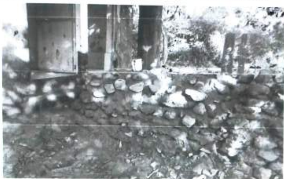
Constructed Compound Wall