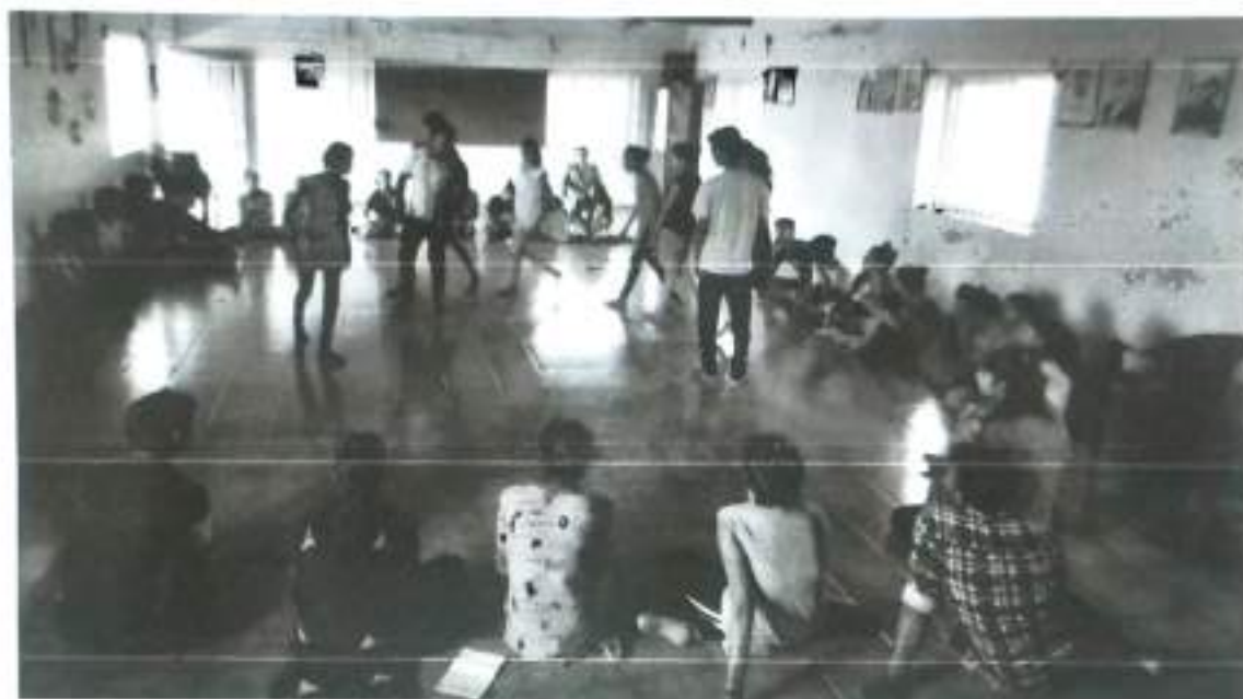
Street Play Competition