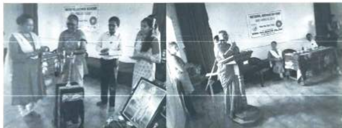
Inauguration of Camp