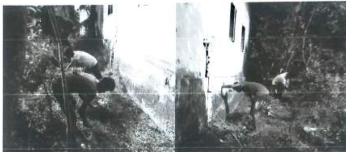
Cleaning of School Campus