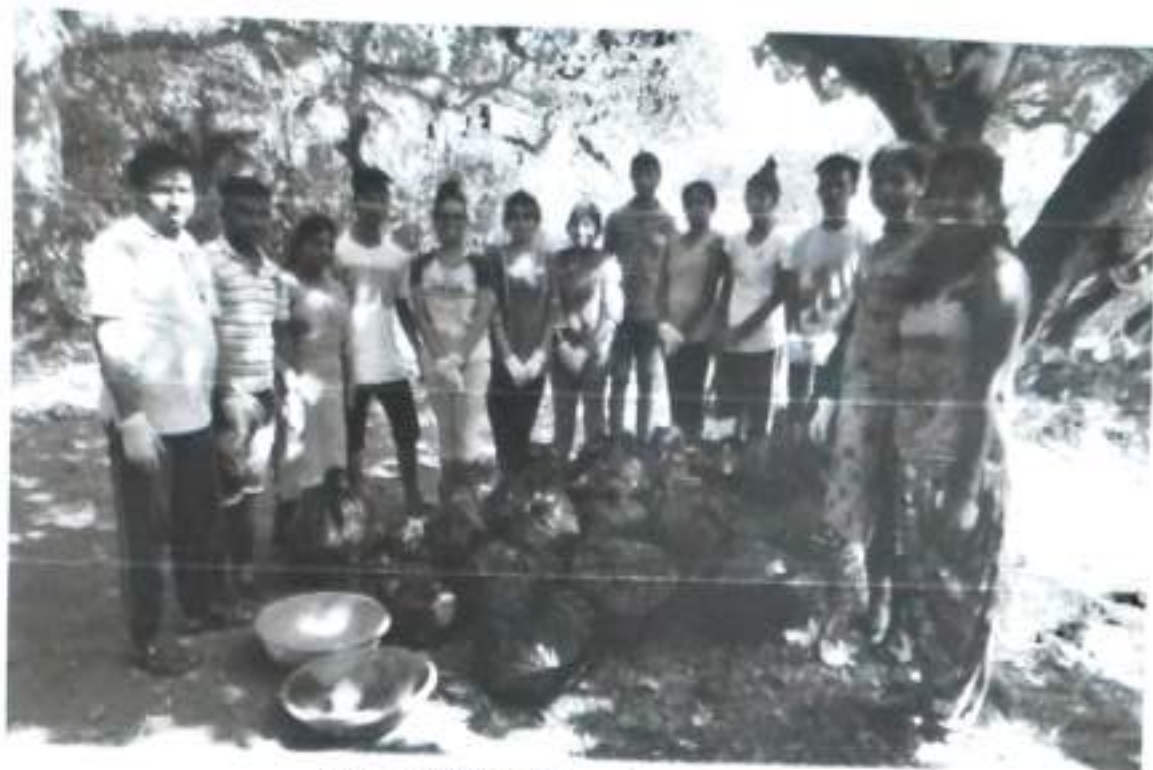
Collected Plastic Waste from Compost Pit