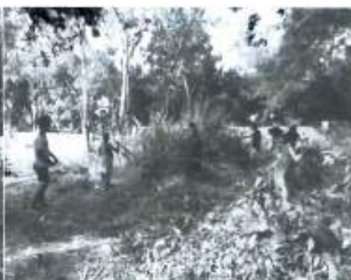
Cleaning in progress