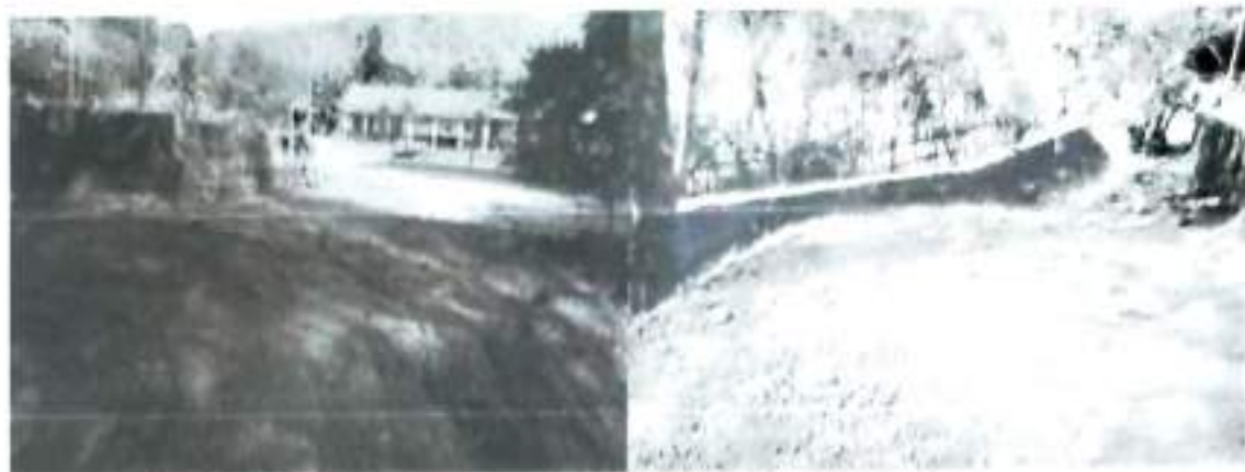
Levelled Portion of Ground