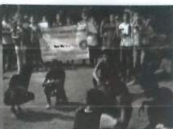
Street Play at Bhars