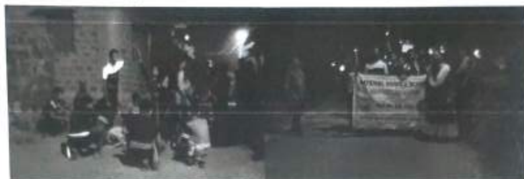
Street Play at Kinalkatta