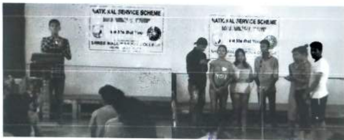
Solo & Group Singing