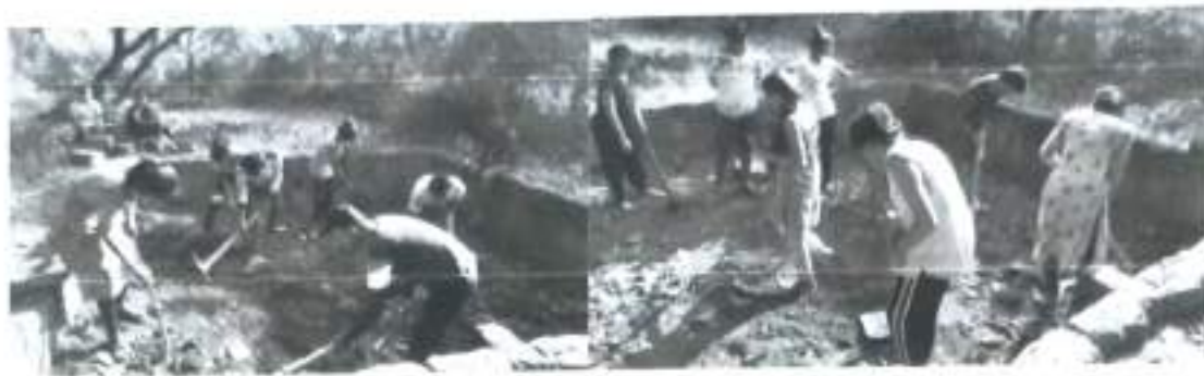
Cleaning & digging of Compost Pit in progress

Under physical work activity, our volunteers with amazing enthusiasm completed the school project assigned by school authorities. This includes construction of school compound wall, cleaning and deepening of compost pit, cleaning and leveling of school ground, reconstruction of steps attached to school ground and covering of the compound opening with stones and mud