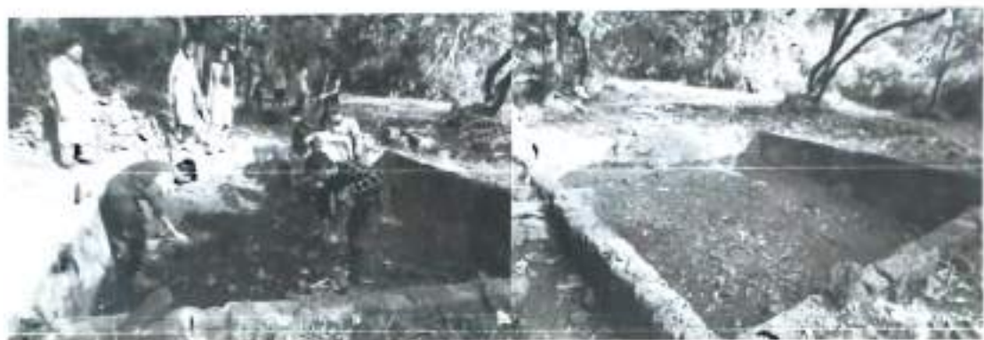
Compost Pit after completion of work