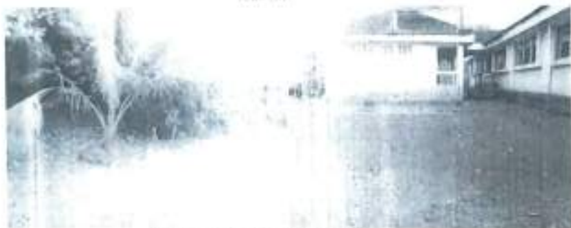
After beautification and cleaning