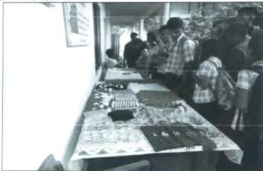
Rakhee display and sale by students of Lokvishwas Pratisthan